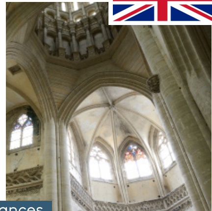
Discovering • Coutances